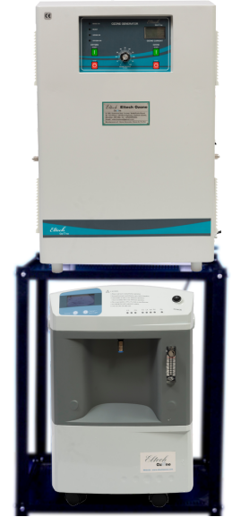
Ozone Generator and Oxygen Concentrator